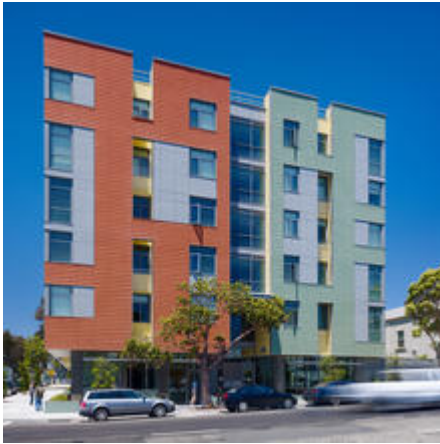
Merritt Crossing Senior Apartments

Located at the edge of Oakland's Chinatown, this new affordable senior housing transforms an abandoned site near a busy freeway into a community asset for disadvantaged or formerly homeless seniors while setting a high standard for sustainable and universal design.