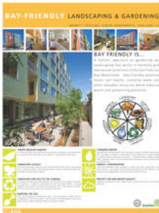
Bay Friendly educational signage located in the building lobby - Photo Credit: Architect

Located in mixed neighborhood in downtown Oakland, the site for this project was a vacant lot that was a gas station at one time. The site is adjacent to both residential and commercial properties and is across the street from a major urban elevated freeway. The existing ecosystem was poor.