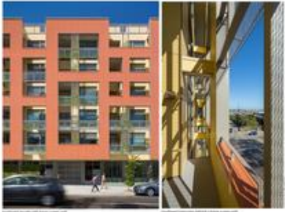
LEFT: Southwest facade with living screen wall; RIGHT: Southwest balconies behind a living screen wall