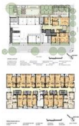
Floor Plans - Photo Credit: Architect