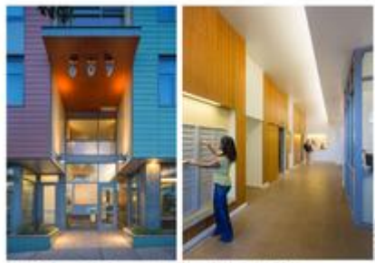
LEFT: Main entrance flanked by management office and community room; RIGHT: Main lobby with high-durability and renewable finishes