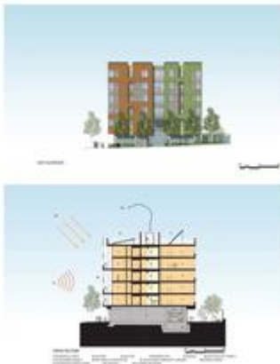
East Elevation and Cross Section - Photo Credit: Architect