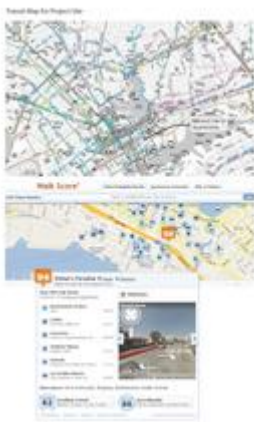
TOP: Transit map BOTTOM: Walkability/Transit/Cycling Score

Merritt Crossing Senior Apartments provides critically needed affordable housing and on-site services to low income seniors in the Chinatown neighborhood in downtown Oakland. Many of the residents were challenged by homelessness and physical or mental illness. As an infill development, it transformed a vacant property into a community asset.