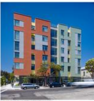
Southeast facade with rainscreen cladding and high- performance windows