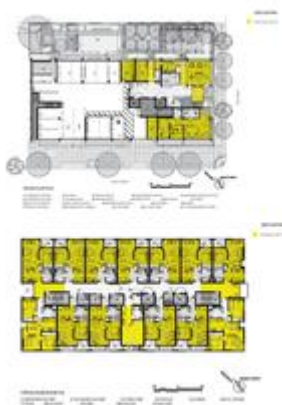
Daylight plan diagrams -