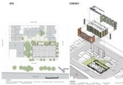
Site and Context Plans - Photo Credit: Architect