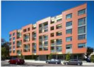
TOP: New high-density development at edge of eclectic mixed-use neighborhood; BOTTOM: Southwest facade with screen wall facing adjacent freeway