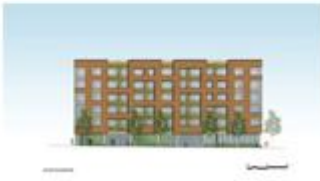
North and South Elevations - Photo Credit: Architect