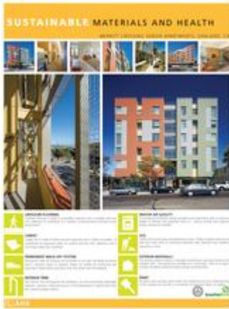
Sustainable materials signage located in the building lobby - Photo Credit: Architect

Multiple design strategies model respect for natural resources and achieve healthy living spaces.