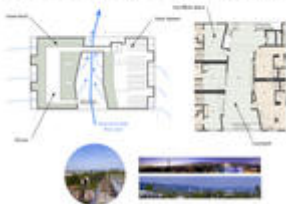
Two photos show views of the central courtyard (above).