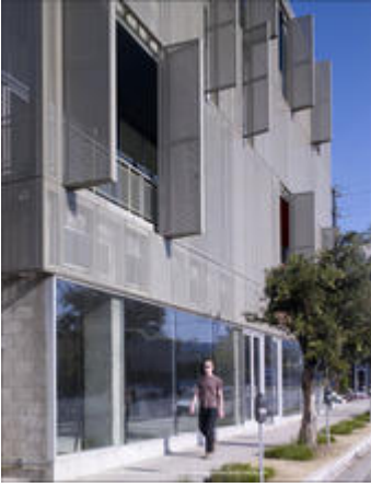
A detail view of the retail space and facade system are seen in this photo, including a planted median with an underground stormwater retention system.