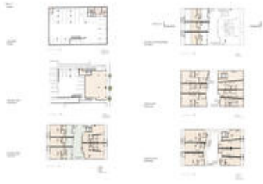
These drawings show floor plans of apartments and townhouses on each floor of the building. - Photo Credit: Brooks + Scarpa