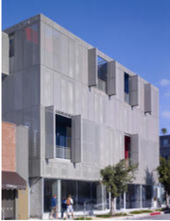
A street view looking northwest is shown in the photo.

This urban infill, mixed-use, market-rate housing project was designed to incorporate green design as a way of marketing a green lifestyle. It is pending LEED Platinum certification. The design maximizes the opportunities of the mild Southern California climate with a passive cooling strategy using cross-ventilation and thermal convection while taking advantage of the abundantly sunny location. A commitment to minimizing the project's ecological footprint informed all aspects of the design.