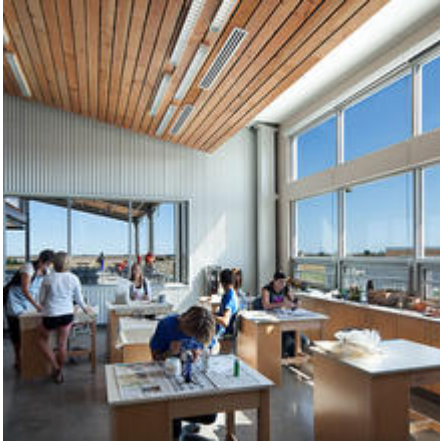
This photo shows a laboratory classroom in the middle school, featuring daylight, views, and natural ventilation.