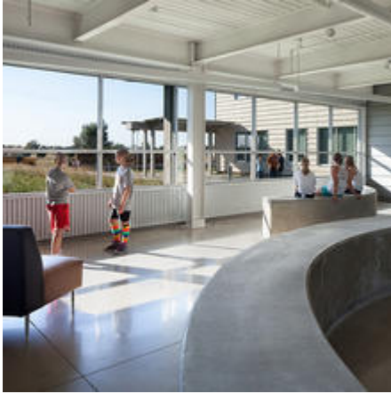
This photo shows the school lobby, another daylight-flooded gathering space.

Since daylighting optimization, ventilation, and indoor air quality have a great impact on student academic performance and the health and comfort of building occupants, these ideas became a central focus of the design. Daylighting and controls, operable windows, maximized views, classroom controls, outdoor classrooms and lunch areas, a courtyard playground, and shared learning spaces are all employed in the creation of a comfortable learning environment with a strong connection to the outdoors.