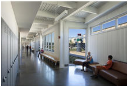
A daylit corridor with views to the courtyard playground can be seen in this photo.