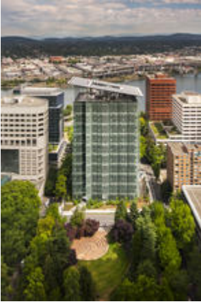
View from neighboring building, looking east - Photo Credit: Nic Lehoux