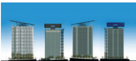
Building elevations