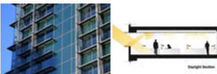
Because of the importance daylighting plays in human health and comfort, the project optimized daylighting in the perimeter zone utilizing a task/ambient approach to lighting.