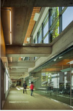
Daylight penetrates to underground conference level.

Based on the design, analysis, and construction process alone, EGWW appears to be a remarkably successful renovation. But success lies in how well the building actually performs. Recognition of this fact has led to a set of aftercare studies and services to fine-tune the building's performance – both for energy efficiency and occupant satisfaction.