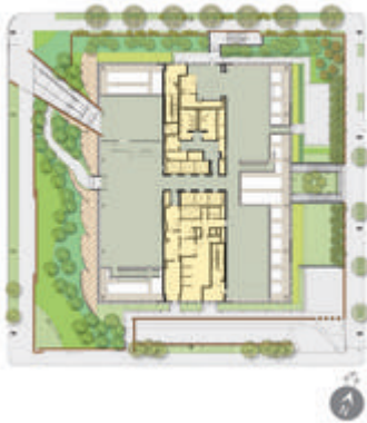
Entry plan