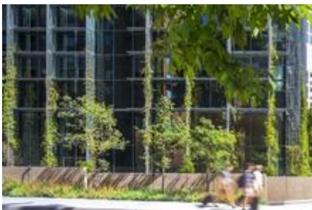
Climbing vines offer seasonal interest, wildlife habitat and a visual cue of the government's commitment to greenbuilding.