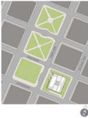
Site plan