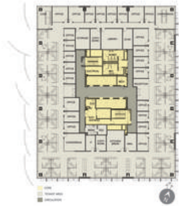
Typical tenant floorplan - Photo Credit: SERA