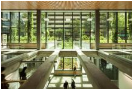
Exposed elements from the existing building were left intact to reveal building history.