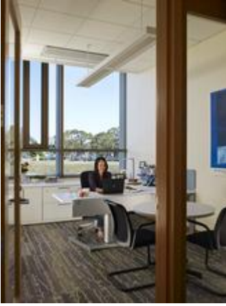
Private office with ample daylight and operable windows.