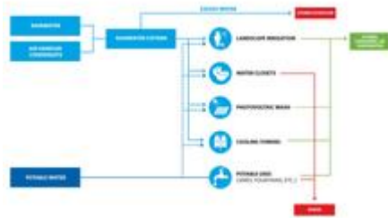
Water diagram. - Photo