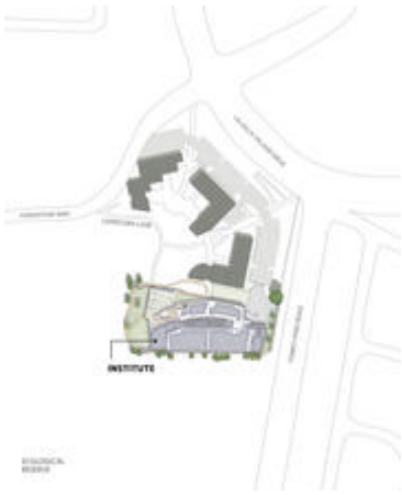
Site plan shows relationship of Institute to Reserve, neighborhood, streets, and future buildings.

Site improvements were based on design principles developed in the Scripps Institution of Oceanography Upper Mesa Neighborhood Planning Study. Recognizing that the site's primary advantage was its view of the ocean and adjacent Ecological Reserve, the building's orientation and landscape design were planned to highlight these features and create positive connections to the immediate neighborhood, while responding to local climate and site influences. The building's configuration on the site also provides the groundwork for linking the building's terrace and first level to a future promenade and to future UCSD research buildings. Also considered was public access around and through the site via all-weather paths. And, since water conservation is a prime driver in the San Diego region, in addition to a 60% reduction in domestic water consumption, the facility also utilizes captured stormwater for reuse in the toilets and cooling tower, as well as drought resistant landscaping. Finally, the facility is pre-piped to allow the use of regional reuse water, once put into operation by the City.