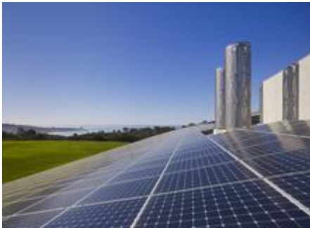
Photovoltaic panels help power the building.

The project's NZE approach led to several integrate strategies. First, unlike buildings that use electricity for cooling, then reject building heat into the atmosphere, and burn gas at night for heat generation, this project utilizes a 50,000-gallon Thermal Energy Storage (TES) system as the primary conditioning driver. Cooling towers cool the TES at night; allowing the building to be conditioned most days without electrical chillers. As cooling is drawn out of the TES, it's replaced with warm water that can be used at night for heating purposes. Additionally, reject heating is captured from a separate water loop feeding a water-cooled, low temperature (-80F) freezer farm, and an exhaust air heat recovery from the laboratory exhaust air. This is one of the few buildings, and the only laboratory in California, that does NOT have a natural gas line extended to it, meaning no on-site burning of fossil fuels is taking place to generate heat or for other uses, except for the diesel fire generator, used for life safety and minimal stand-by power for laboratory equipment. Furthermore, a large photovoltaic array is sized to over-produce most of the year, pushing energy into the grid and putting the NZE goal within reach.