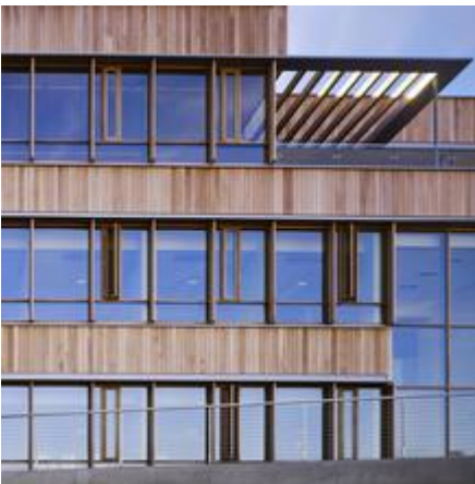
Operable windows shown from exterior.

Regardless of one's location in the building, each occupant can maintain a connection to nature via unobstructed views outdoors through large windows. Even the garage has openings that allow for its natural ventilation, while providing views out to the landscaped grounds and natural surroundings. Office occupants have views north or to the courtyard. Laboratory occupants have views south and also into the courtyard. The windows that look into the courtyard, also provide connections among occupants. The use of overhangs and shading devices, in combination with automatic and manual shades that mitigate glare issues, provide day-lit spaces, even on a cloudy day, such that 80-90% of the occupants rely solely on daylight during daylight hours. Occupant control features include over-ride of the automatic shades, light-level control down to an office level, and operable windows in all office areas. Conditioning only the ventilation air required for the space, allowed for the use of a 100% OSA system for the offices. Internal and external loads are mitigated via hydronic heating and cooling, primarily via induction beams—chilled beams that have cooling and heating capabilities.