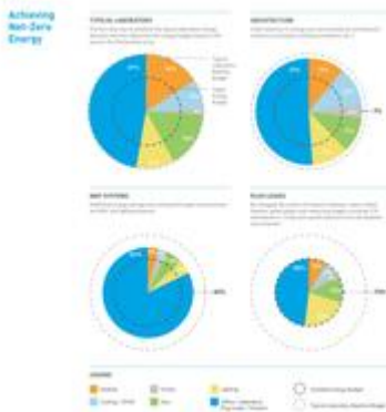
Energy diagrams.