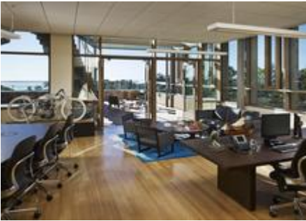
Executive office shows interior finishes against a backdrop of sea and Ecological Reserve vistas.