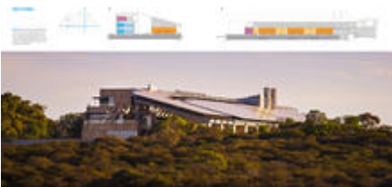
Additional building sections