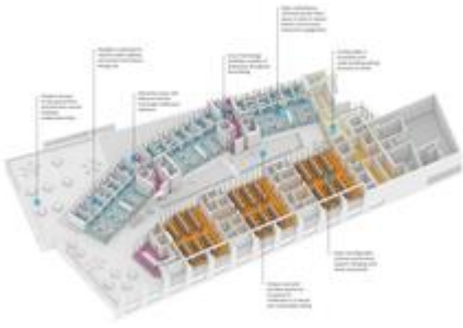
Axon of interior spaces shows how sustainability features were applied.